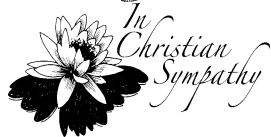
In Christian Sympathy