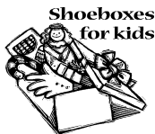
Shoeboxes for kids