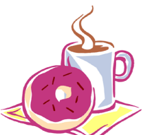
coffee & donuts